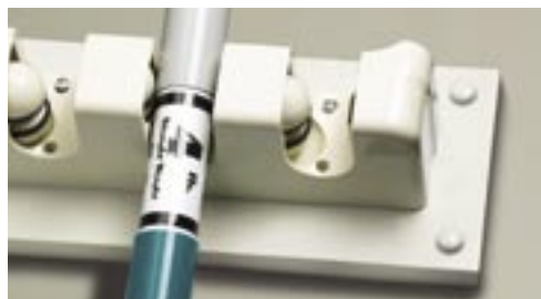
Innovative grip system holds weight bars in place