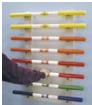
BarRacs 4716B & 4716D can also be used to store weight bars.