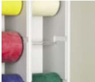
Quick change band tubing