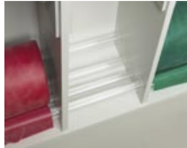
All sections are easy to load and unload. Band rests on rolling tube supports. Holds many brands of exercise band.