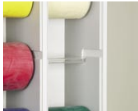
All sections are easy to load and unload with self aligning grooved insert—no exposed inner core of the board, or unfinished wood dowels to hold band rolls.