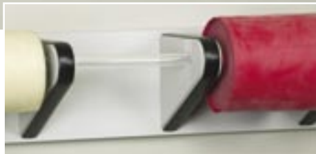
All sections are easy to load and unload.