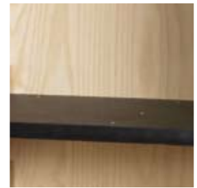
ABS plastic on shelves