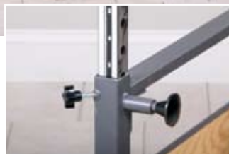
Indexing plunger and height indicator strip