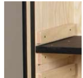
Double thick sides