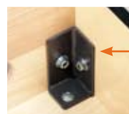
Two Triple Bolted Corners on each box