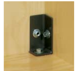
Triple bolted corners